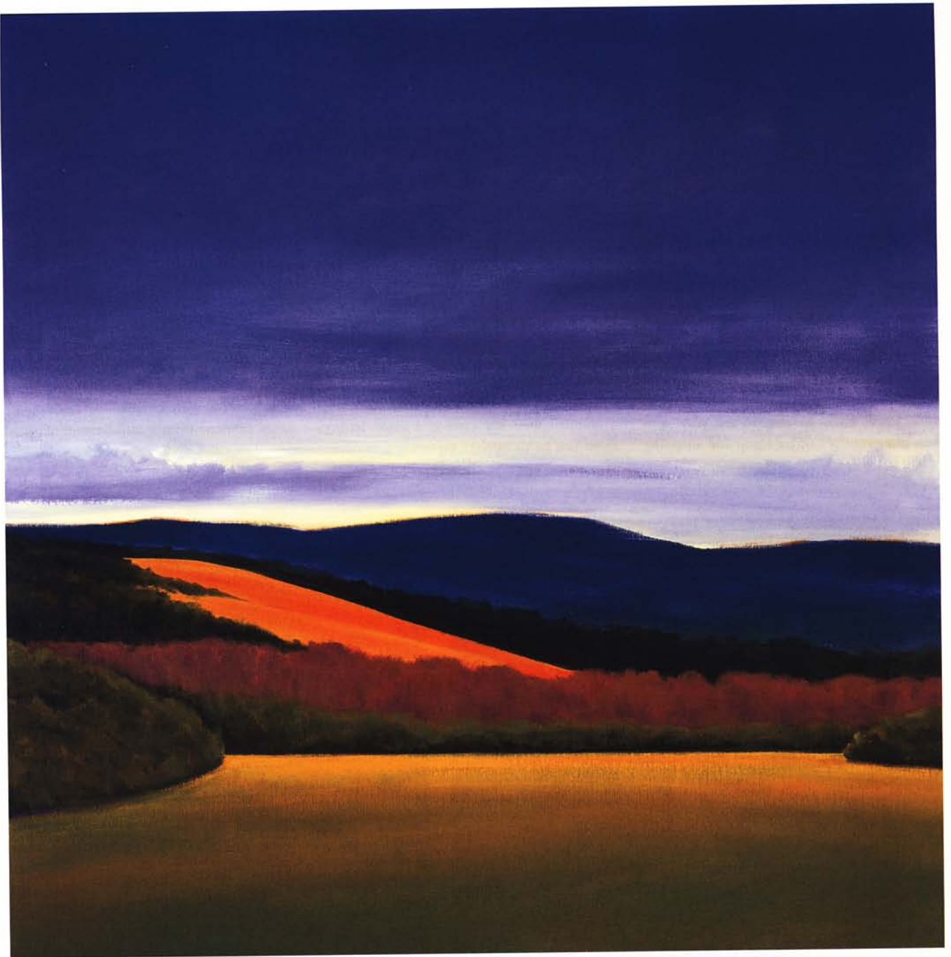
SUNDOWN MISSION RANCH, OIL ON CANVAS, 36 X 36"