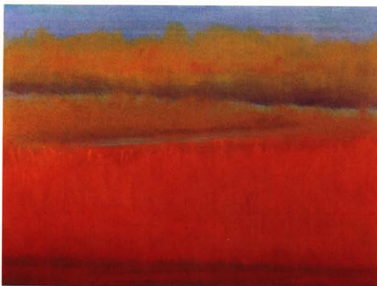
BLACKBIRD SINGS, OIL ON CANVAS, 30 X 40"