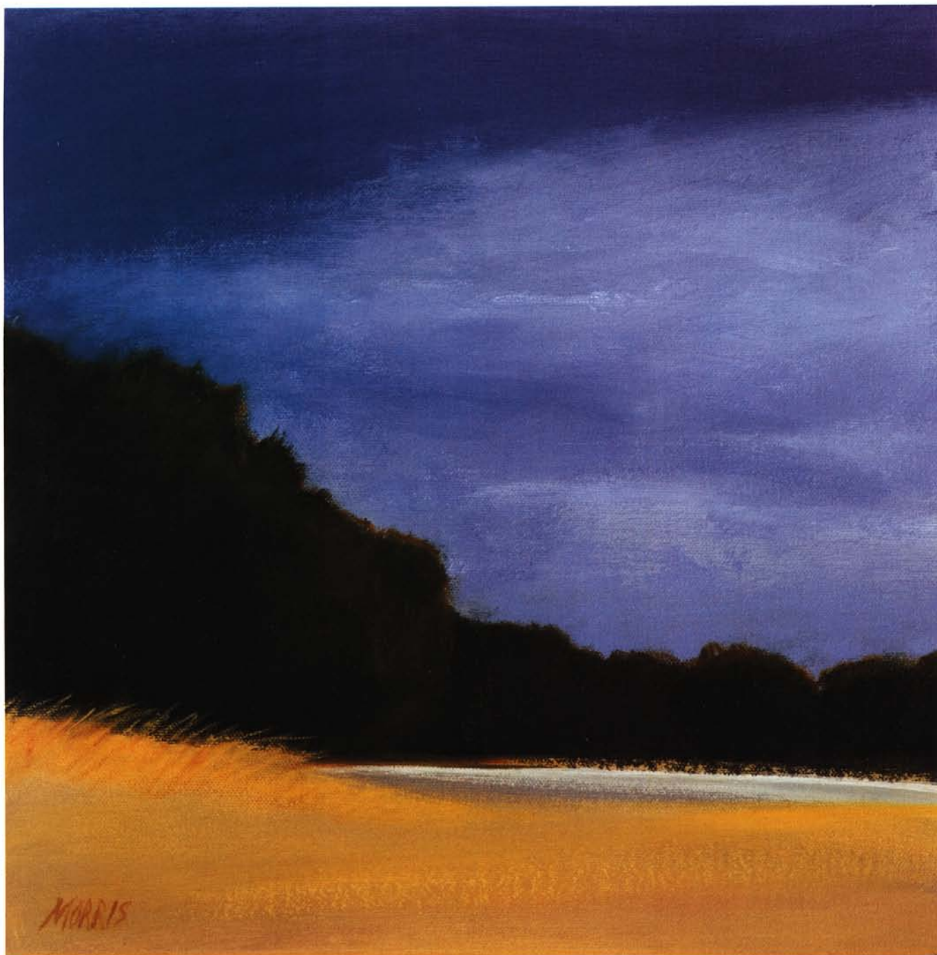
WOODSIDE POND, OIL ON CANVAS, 12 X 12"

shapes in the composition—all of this relates to this experimental spirit and creative energy that shines through her work.