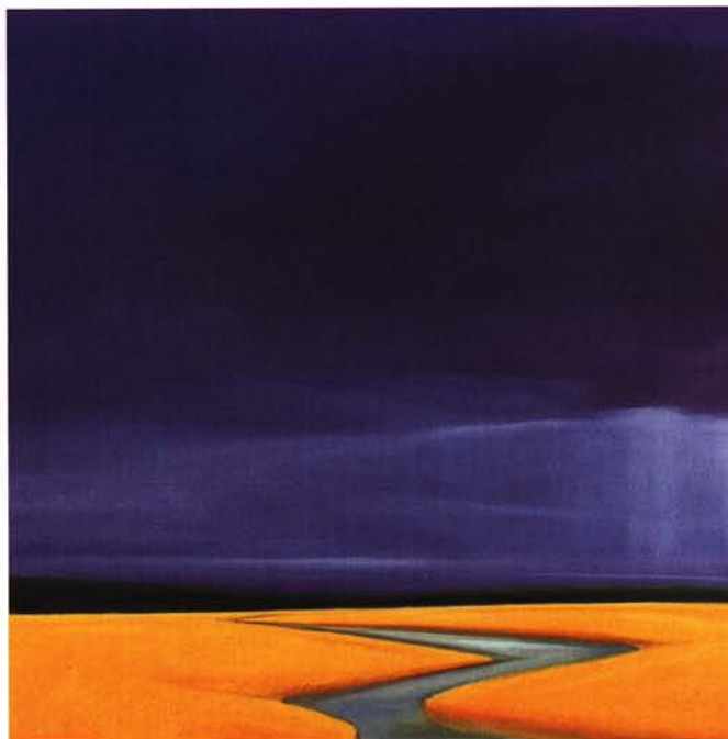
THE RAIN, OIL ON CANVAS, 36 X 36"