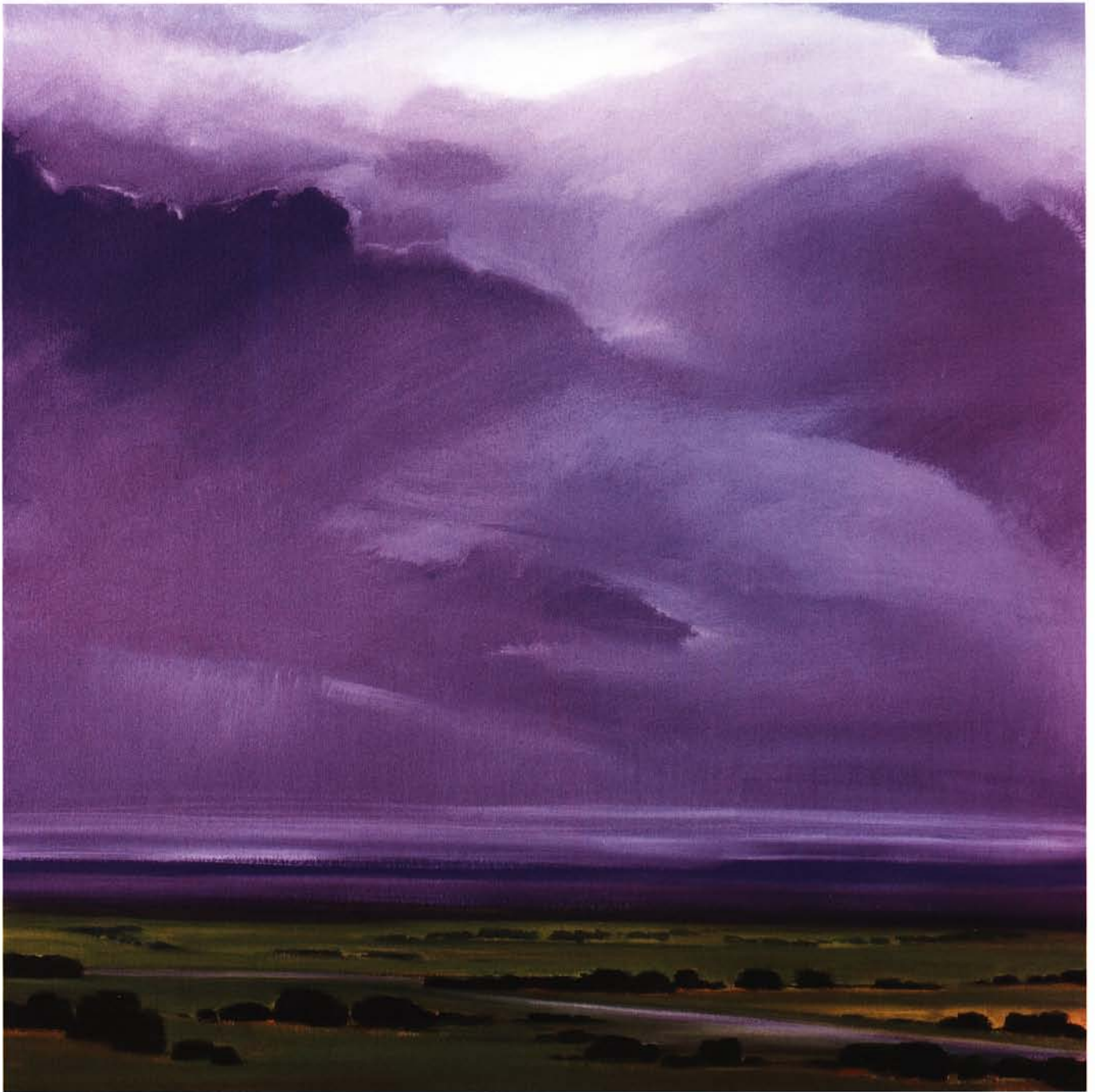
THE CLEARING, OIL ON CANVAS, 36 X 36"