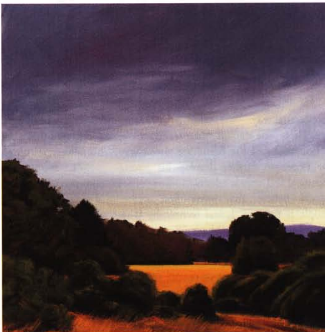
HIGH COUNTRY, OIL ON CANVAS, 18 X 18"